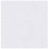
LM02 blanco climb