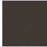
LM21 gris Londres Fenix