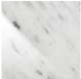
BC blanco Carrara brillo