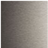
acero inox satinado