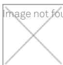
seccion de tronco de roble