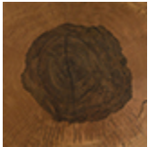
seccion de tronco de roble