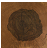
seccion de tronco de roble