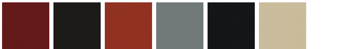
89 ROSSO CORSA