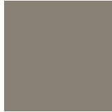
OP30 grey mate