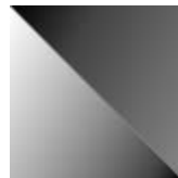
grafito extra claro