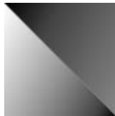
grafito extra claro