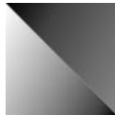
grafito extra claro