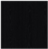
fr73 fresno barnizado negro mate a poro abierto