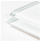
cristal extraclaro translúcido barnizado blanco