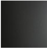
OP69 graphite mate