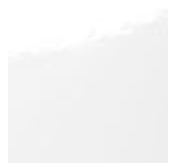
L7 lacado blanco brillo