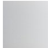
GFM71 gofrado blanco