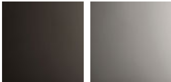
06 cromo negro