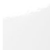
L7 lacado blanco brillo