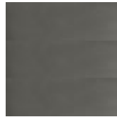
OP0 barnizado transparente