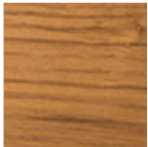
HR roble Heritage