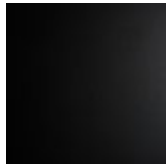
OP17 negro mate