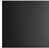
OP69 graphite mate