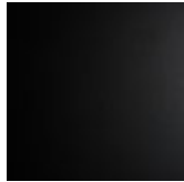
OP17 negro mate