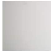
OP71 blanco mate