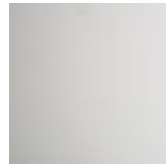
OP71 blanco mate