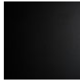
OP17 negro mate