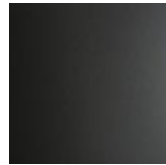
OP69 graphite mate