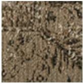
algodón y felpa Delhi