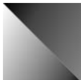
transparente extraclaro biselado