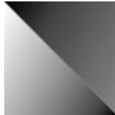
transparente extraclaro biselado