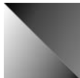
transparente extraclaro biselado