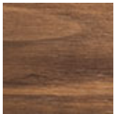
NC nogal canaletto