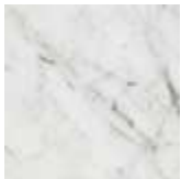
BCO blanco Carrara mate