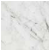
BCO blanco Carrara mate