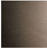
11 titane satiné