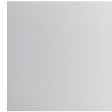
GFM71 gaufré balnc