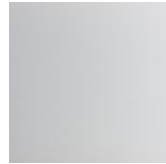
GFM71 gaufré balnc