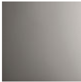
acier inox poli