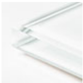
verre extraclair verni blanc acide