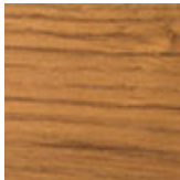
HR rouvre Heritage