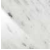
BC blanc Carrara brillant