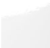
laminé blanc brillant