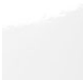
laminé blanc brillant