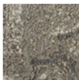
chenille du coton Chennai