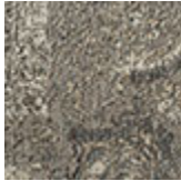
chenille du coton Chennai