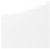
L7 laqué blanc brillant