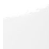
L7 laqué blanc brillant