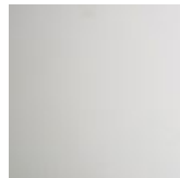
OP71 blanc mat