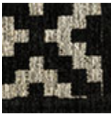
chenille du coton noir Halibut