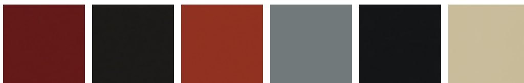
89 ROSSO CORSA coutures NOIR