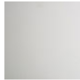
OP71 blanc mat