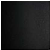
GFM73 gaufré noir