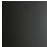
OP69 graphite mat