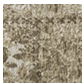
chenille du coton Jaipur