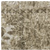
chenille du coton Jaipur