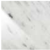
BC blanc Carrara brillant