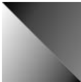
extra clair graphite