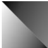
extra clair graphite