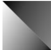
extra clair graphite