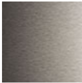
acier inox satiné