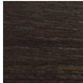
RB rouvre brulé