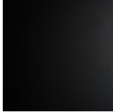
OP17 noir mat