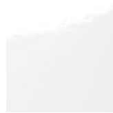
L7 laqué blanc brillant