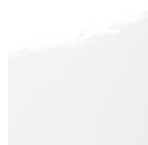
L7 laqué blanc brillant