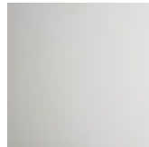
OP71 blanc mat