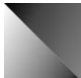
extra clair graphite