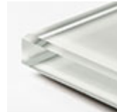
oyster extra clear