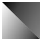
extra clair graphite