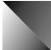
extra clair graphite