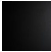
OP17 noir mat