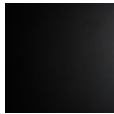
OP17 noir mat