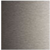
acier inox satiné