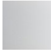
GFM71 gaufré balnc