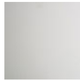
OP71 blanc mat