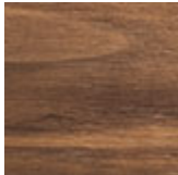
NC noyer canaletto