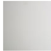
OP71 blanc mat