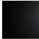
OP17 noir mat