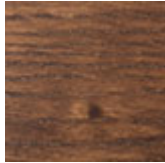
frNC frêne teinté noyer Canaletto