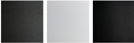
GFM69 gaufré graphite