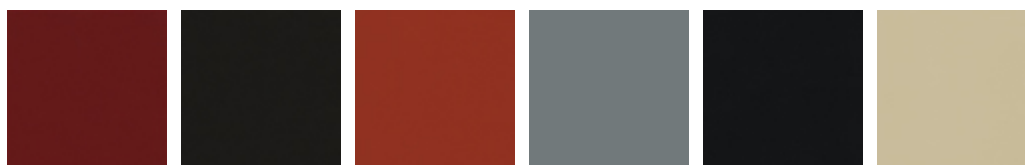
89 ROSSO CORSA coutures NOIR