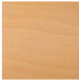
F1 hêtre naturel