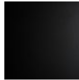
OP17 noir mat