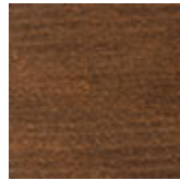
FNC hêtre teinté noyer canaletto