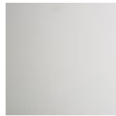
OP71 blanc mat