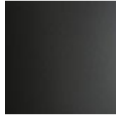
OP69 graphite mat