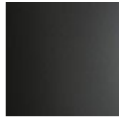
OP69 graphite mat