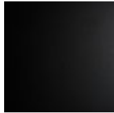
0P17 noir mat