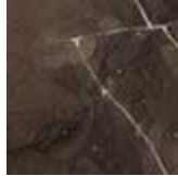
EBO Ebano mat