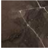
EBO Ebano mat