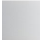
GFM71 gaufré blanc