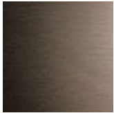
11 titane satiné