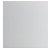
GFM71 gaufré blanc